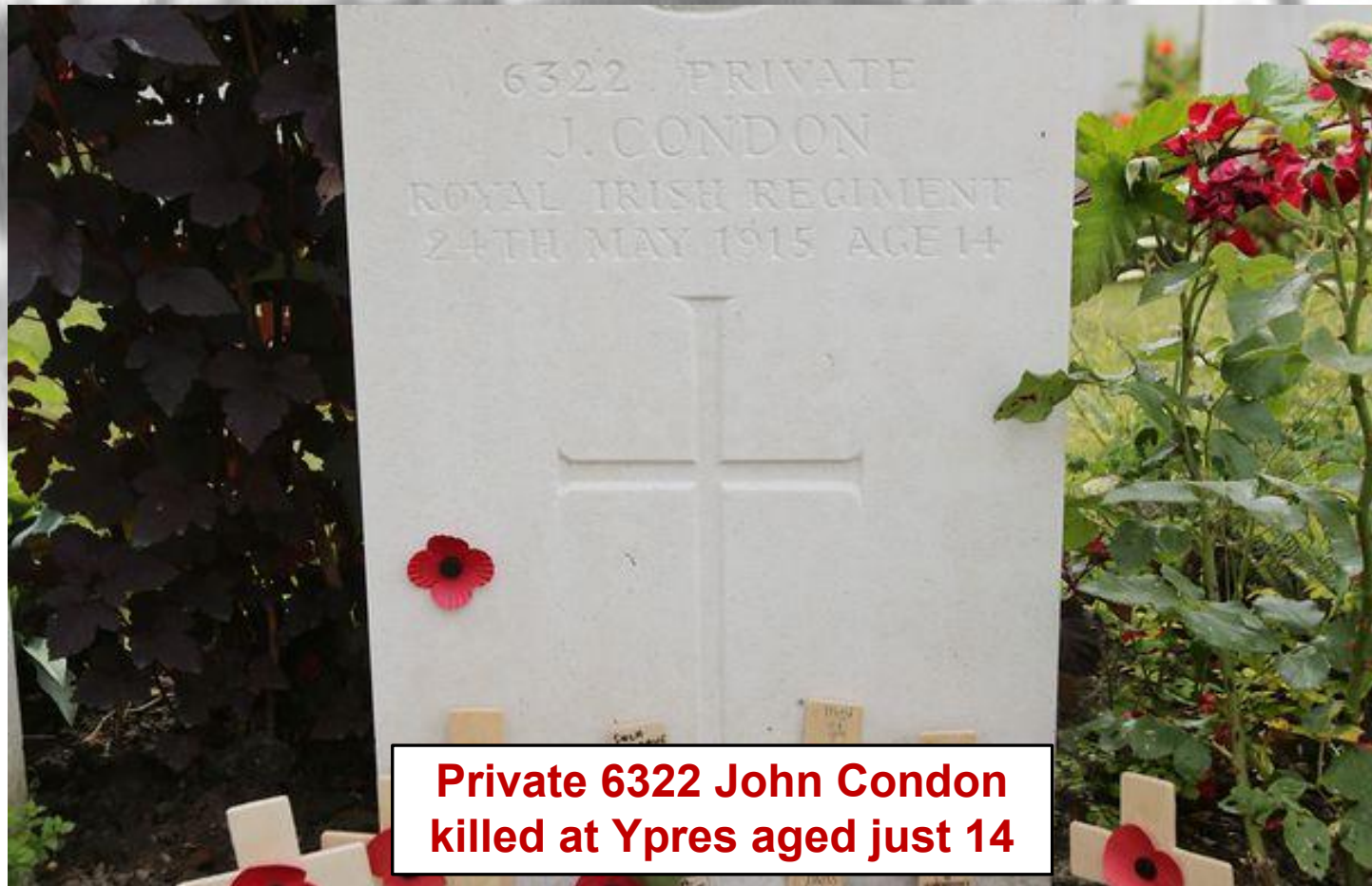
Private 6322 John Condon killed at Ypres aged just 14