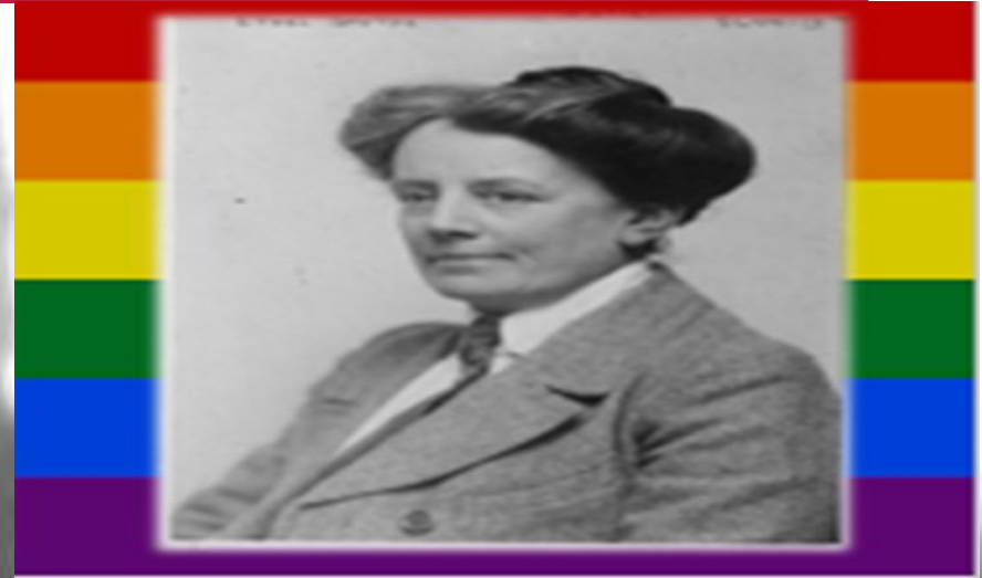
Ethel Mary Smyth

Ethel had romantic relationships with women and frequently wore male clothing. Ethel was a suffragette and was briefly imprisoned for her activities in 1912.