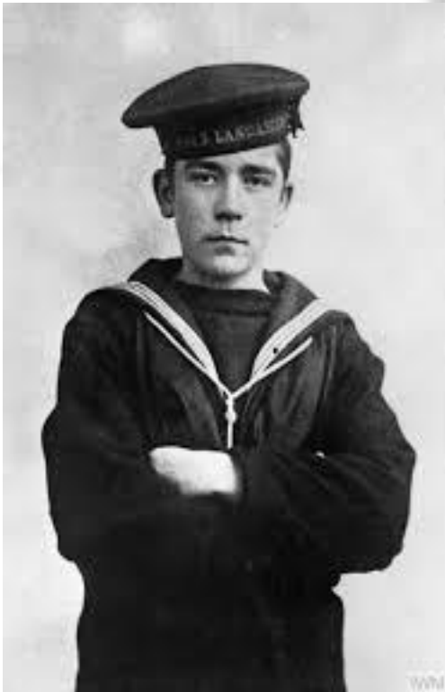
Jack Cornwall Victoria Cross Award 16yrs Died 1916